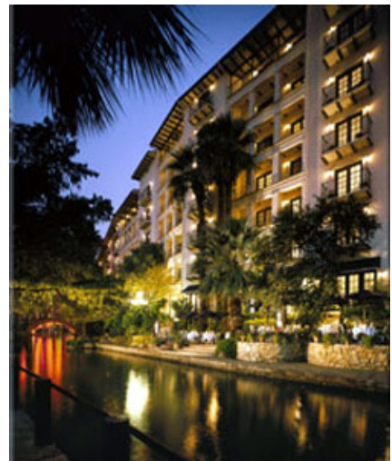
La Mansion Del Rio Hotel

Get ready for the Society's 19th Annual Meeting in San Antonio. Early registration ends August 15. We are working hard to make this the best ever and it will even be better if you are there! We have some great speakers lined up and have a wonderful location - La Mansion Del Rio Hotel which is on the famed River Walk (Paseo Del Rio). The meeting will kick off with our Welcome reception Sunday evening (September 11). The reception is a nice opportunity to say hello to old friends and make some new ones. Monday will be a full day starting with a continental breakfast and ending with a great reception on the river walk. As a special event, we have arranged a private walking tour of the Alamo before the reception. Tuesday