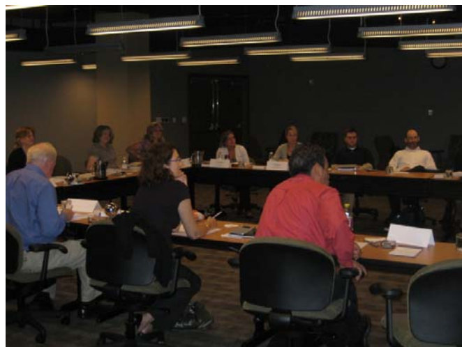
SDP Training in Action