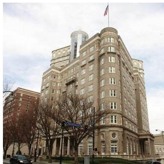
The Georgian Terrace Hotel, the site of the 2011 Conference and Training, in the heart of Atlanta